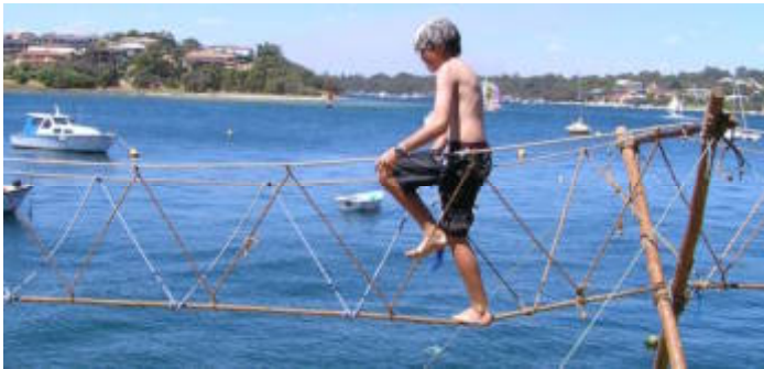
The Venturers built a fantastic Rope Bridge as part of a day of games and activities.

turer Den. This year we plan to continue the work we started, including re-carpeting the floor space, re-painting the cupboards, fixing lights to the roof and finding a way to get bunk beds up the stairs and through the door way, amongst other things. We also plan to update the Venturer