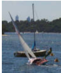
Rovers sailed the fireball to win the dinghy class in 2006

Swan-a-bout is a sailing marathon held each year with all sea scout groups on the Swan River. Teams of Scouts, Venturers and Rovers race around a 7 NM course, covering as many laps as possible in 30 hours. Teams must check in at each base around the