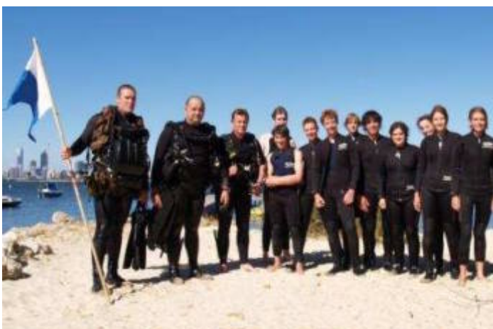
The participants, including the Venturers, in the 'First Ever' Pelican Point Scuba Diving Course.

The first dives that we did were in Claremont Pool, amongst the general public and their gawking stares. It was here that we learnt and performed the practical skills that we would need for the open water dives; including removal and replacement of our gear in and on the water, the all important buddy check, controlled emergency ascent, regulator retrieval and clear and many other useful and possibly life saving techniques.