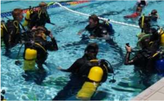
The team taking to the pool as part of their open water dive course.

us being dragged from our warm sleeping bags into the frigid air, and each night ended with us falling asleep in uncooperative, yet exhausted heaps.