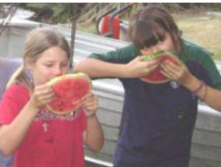
Scouts watermelon eating competition

21 scouts and I hope we will start 2007 with a few more. We finished the year with a sailing, swimming, watermelon eating competition and BBQ. Fun was had by all who attended.